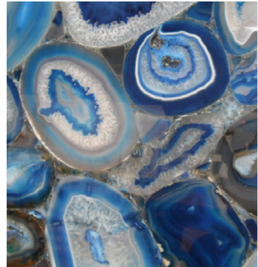
FUTURE PROJECTS AT BANNOCKBURN

The restorations at the house will be ongoing. The first large project will be the kitchen renovation. I am designing it to fit with the historic nature of the house while providing updated amenities.